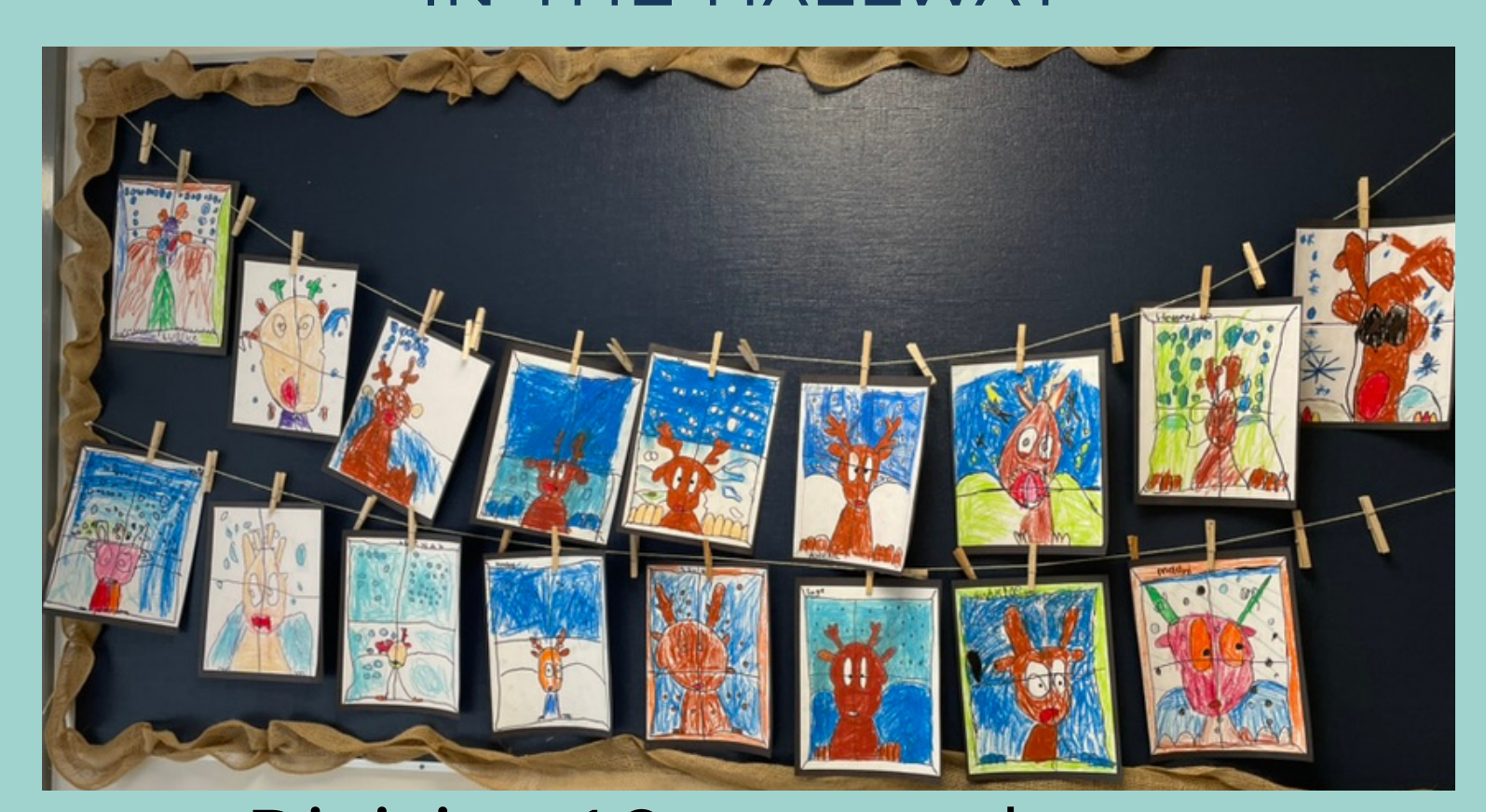
Division 10 watercolours