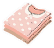
extra clothing including socks

As fall is now with us, a reminder to send students with the appropriate clothing to wear outside in all weather. It is rare that students will have an inside day. Being outside, rain or shine helps to prepare our brains and keep us focused throughout the day. Kingswood